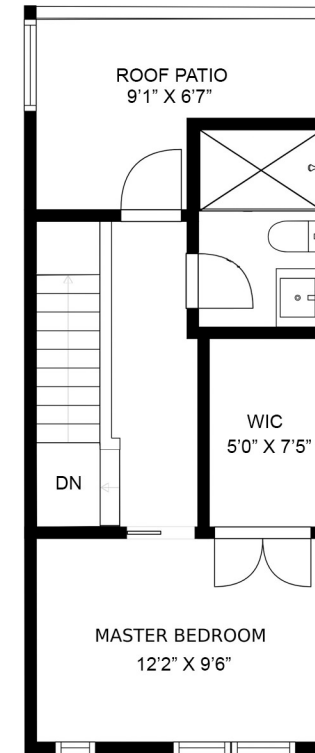
TOP FLOOR: 313 SQFT